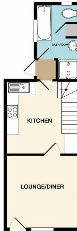
GROUND FLOOR APPROX. FLOOR AREA 324 SQ.FT. (30.1 SQ.M.)

Our particulars are designed to give a fair description of the property, but if there is any point of special importance to you we will be pleased to check the information for you. None of the appliances or services have been tested, should you require to have tests carried out, we will be happy to arrange this for you. Nothing in these particulars is intended to indicate that any carpets or curtains, furnishings or fittings, electrical goods (whether wired in or not), gas fires or light fittings, or any other fixtures not expressly included, are part of the property offered for sale.